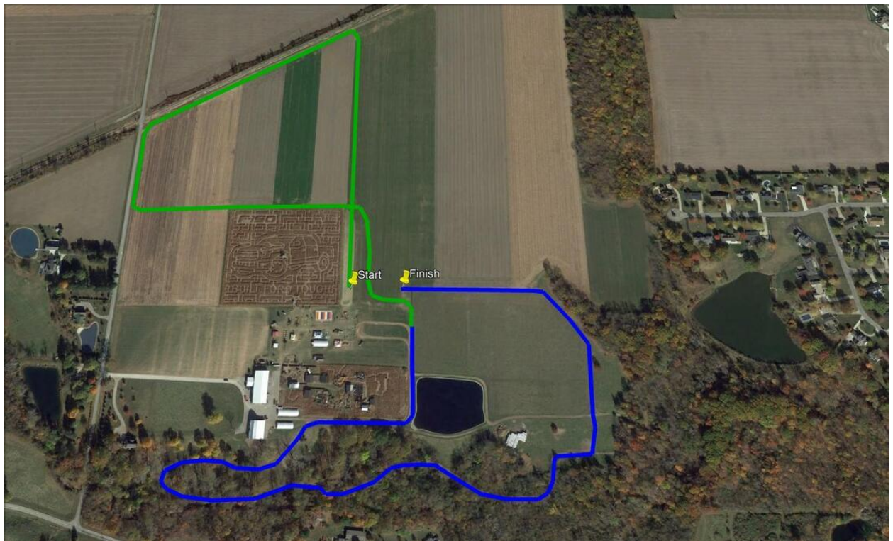
JUNIOR HIGH MAP